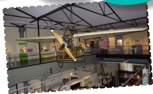
Blériot XI replica at QVMAG

The original Blériot XI is on display at the Smithsonian National Air and Space Museum in the USA. Check out the Blériot XI and other flying machines at https://airandspace.si.edu/