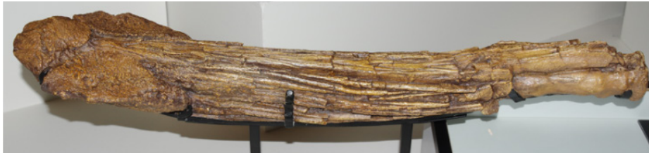
Some armoured dinosaurs like Talarurus had tail clubs.