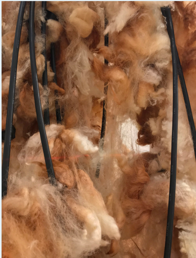
Sue and Peg Pedley, Patches of Light (detail), 2019, wool, power cord, tape

Taken together, the materials of this exhibition are varied (and sometimes smelly to boot): sheep's wool from Deloraine; seaweed from Low Head; electrical cord; annealed wire; old bags of various shapes and sizes, some for wool, some for sand, in hessian and synthetic cloth; scraps of dress fabric. They recall locations and activities beyond the gallery – home, farm, workshop, garden, beach – and speak of past uses and past lives. Like the repurposed wool bag, they frequently relate to a family story or experience. For instance, Low Head at the mouth of the Tamar River, where the seaweed was gathered, is a significant spot for both sides of the family. It saw the arrival of William Field, Sue's convict forebear, and his wife Elizabeth Robley to the colony. Peggy's sea-captain grandfather regularly sailed up and down the Tamar on his way between Melbourne and Launceston. Peggy holidayed at Low Head as a child and later with her own children.