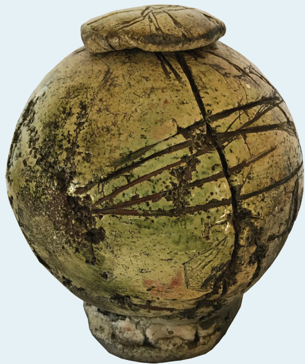
Peg Pedley, raku lidded container , c. 1979, private collection

This exhibition does not set out to dictate. Instead it uses its materials, processes and forms of display to communicate indirectly, by suggestion and invitation. The beauty of this way of working lies in its spaciousness and openness: others can populate it with their own experiences and stories. The exhibition challenges viewers, but it is also genuinely welcoming and generous. Significantly, the conversation that Sue and Peg have cultivated is still developing. No line has been drawn that would mark it off from the present moment, or from the prospect of change in the future. Nothing, this exhibition seems to say, is ever finally done with, buried events are always near at hand, old stories wait to be told again.