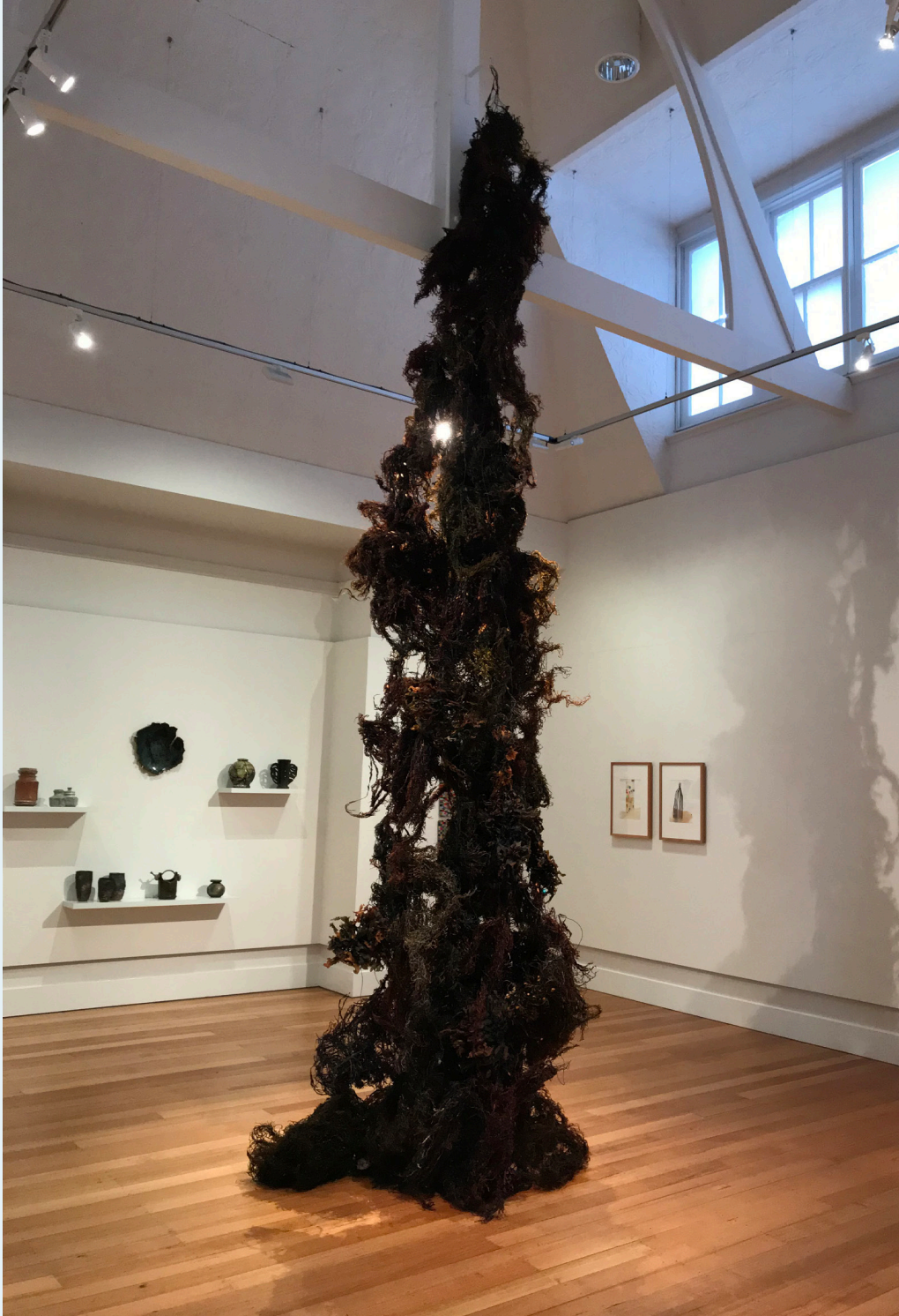
Sue and Peg Pedley, Patches of Light , installation detail at QVMAG, Launceston 2019